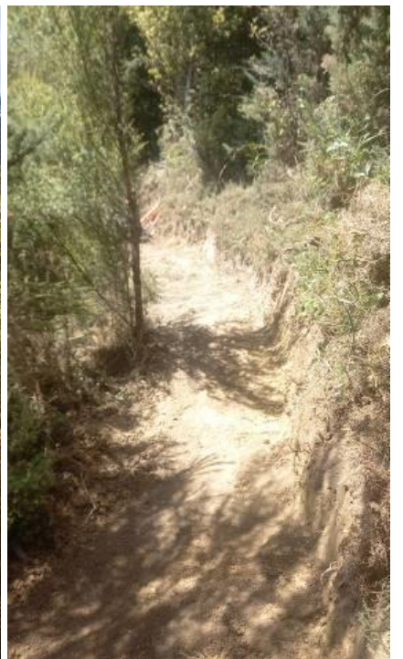
“Old farm track” is now almost runnable